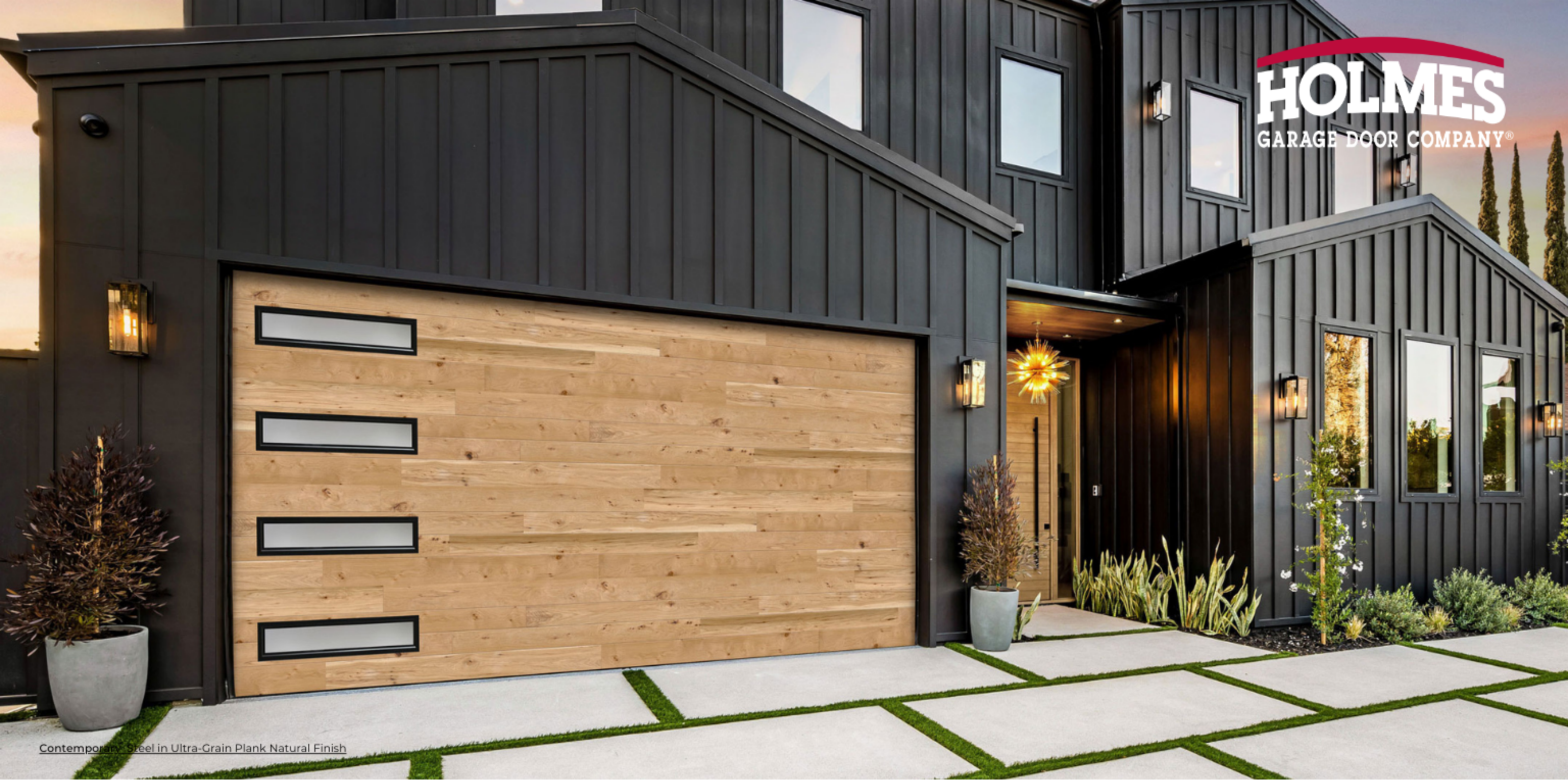
Contemporary Steel in Ultra-Grain Plank Natural Finish