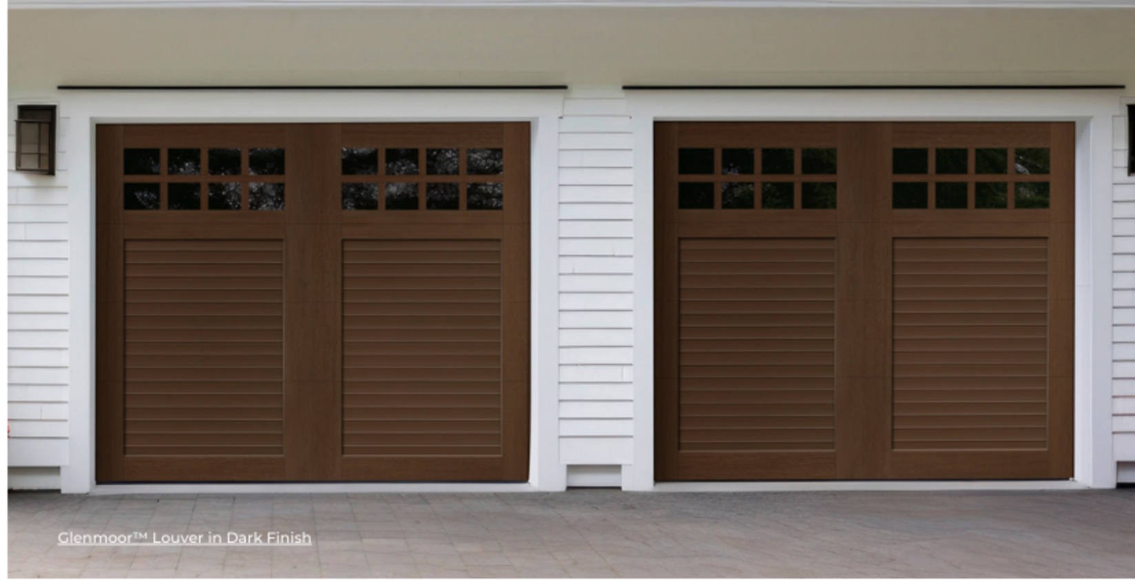
Glenmoor™ Louver in Dark Finish