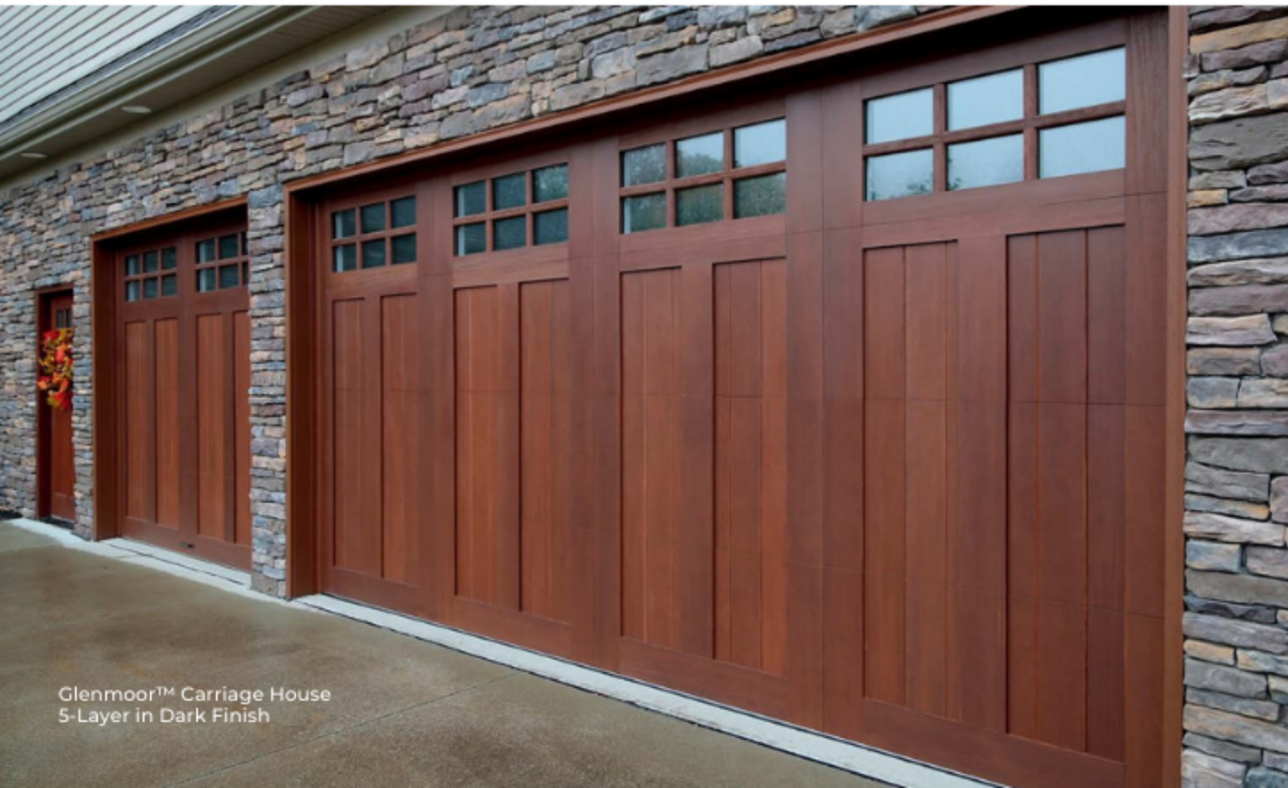
Glenmoor™ Carriage House 5-Layer in Dark Finish

Most home upgrades, including a new garage door, increases a home's value at least a little. But a garage door replacement tops the list of home improvements with the best return on investment at resale. According to Remodeling's National Cost vs. Value Report for 2026, replacing a garage door gives a consumer a 268.8% ROI (Return on Investment)