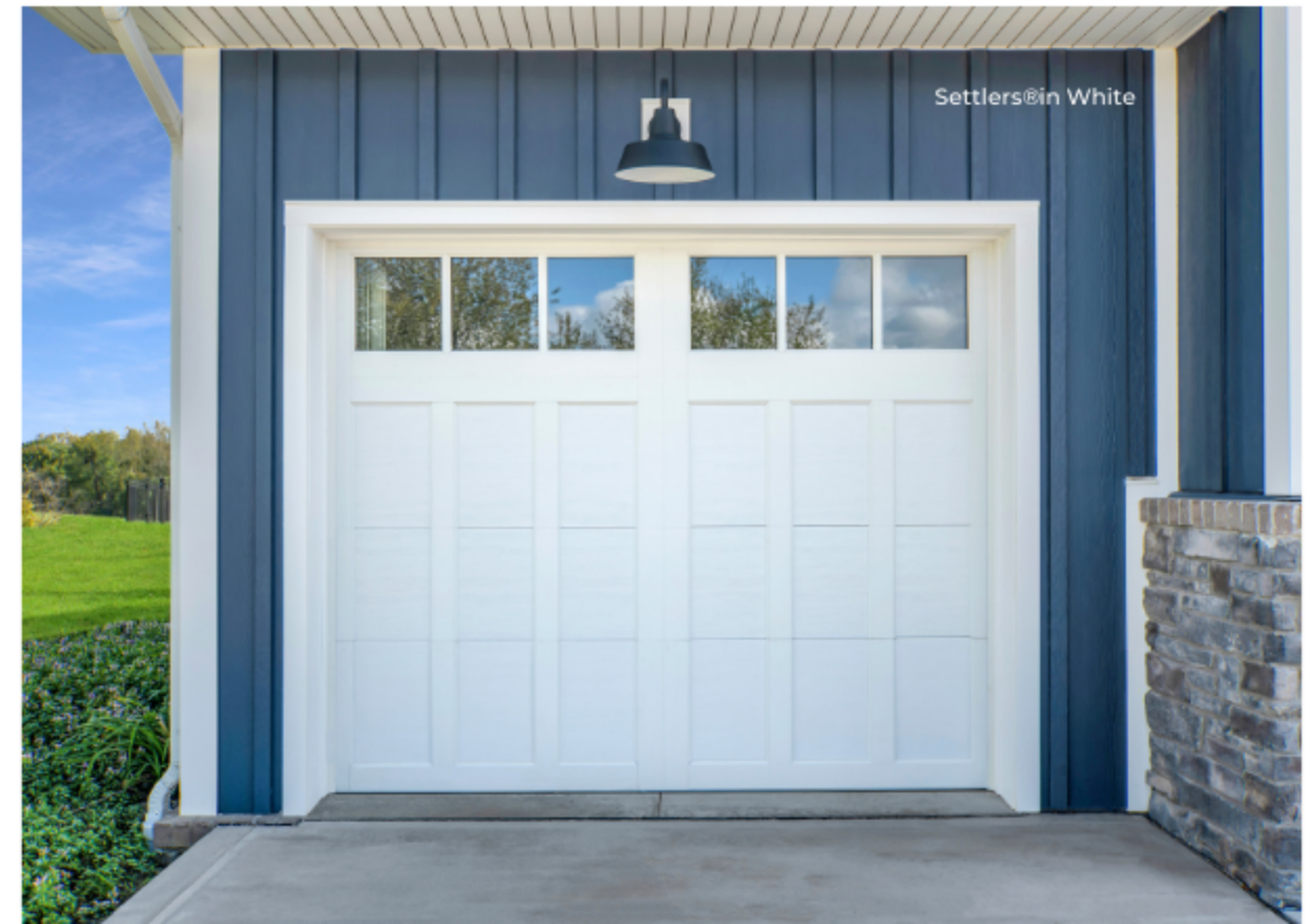
Settlers® in White