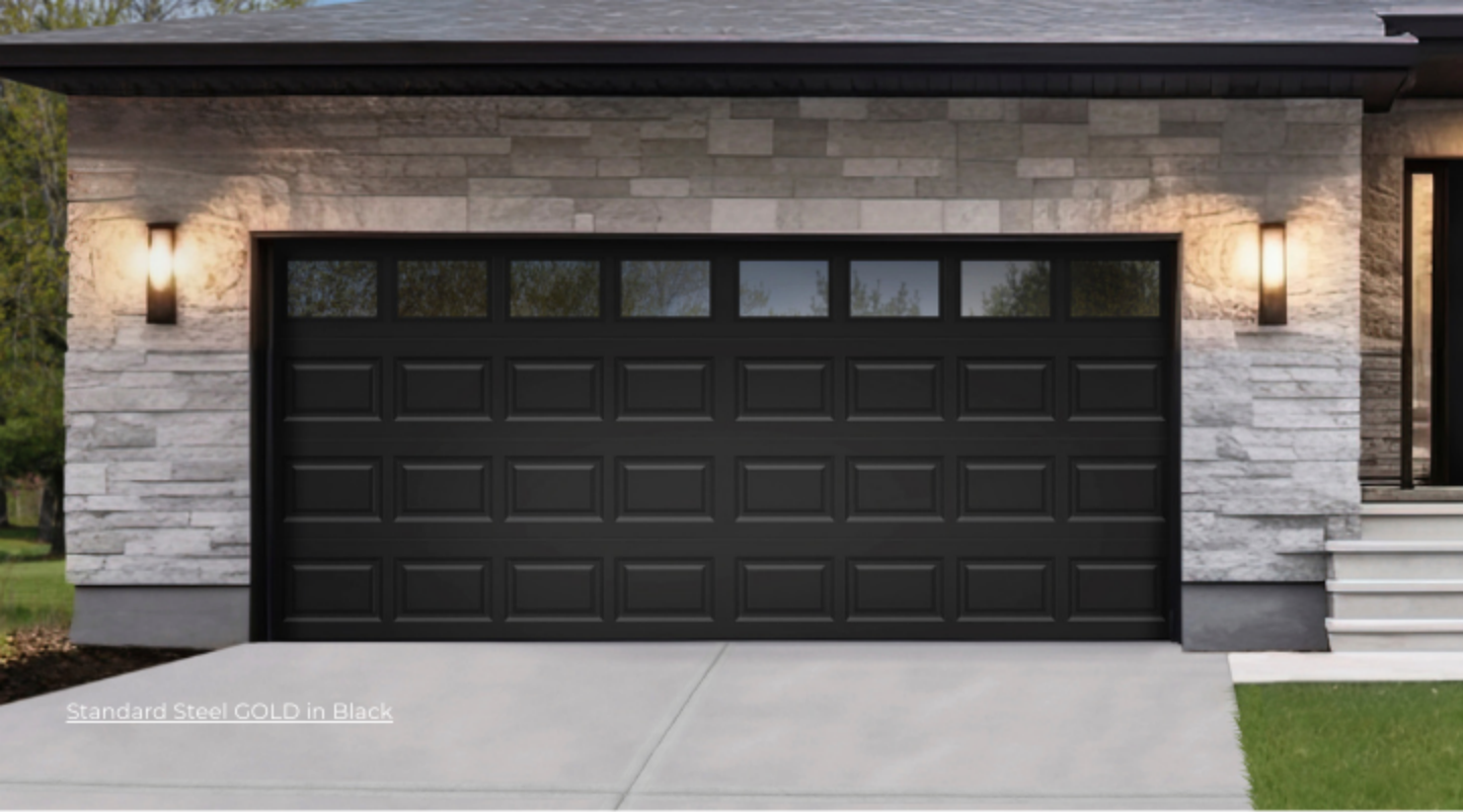
Standard Steel GOLD in Black

Most home upgrades, including a new garage door, increases a home's value at least a little. But a garage door replacement tops the list of home improvements with the best return on investment at resale. According to Remodeling's National Cost vs. Value Report for 2026, replacing a garage door gives a consumer a 268.8% ROI (Return on Investment)