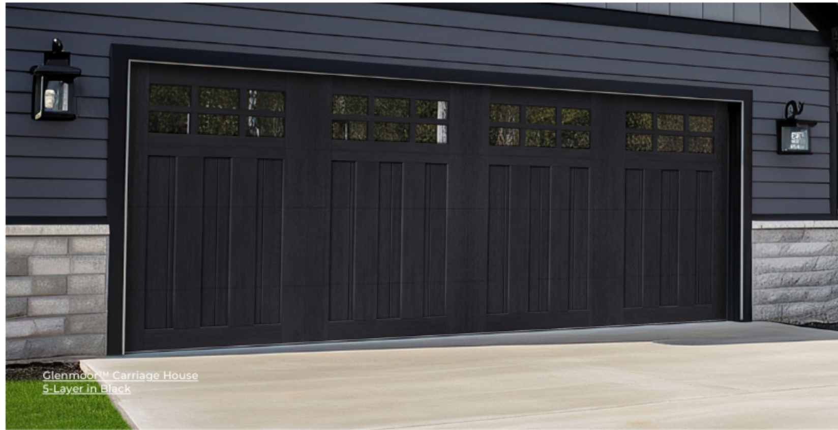
Glenmoor™ Carriage House 5-Layer in Black

Glenmoor products provide beauty and realism of natural wood with less upkeep. Moisture-resistant composites won't rot, warp or crack and are not susceptible to terrible damage. Can be painted or stained.